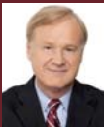
Chris Matthews, Host, "Hardball" on MSNBC and "The Chris Matthews Show" on NBC.