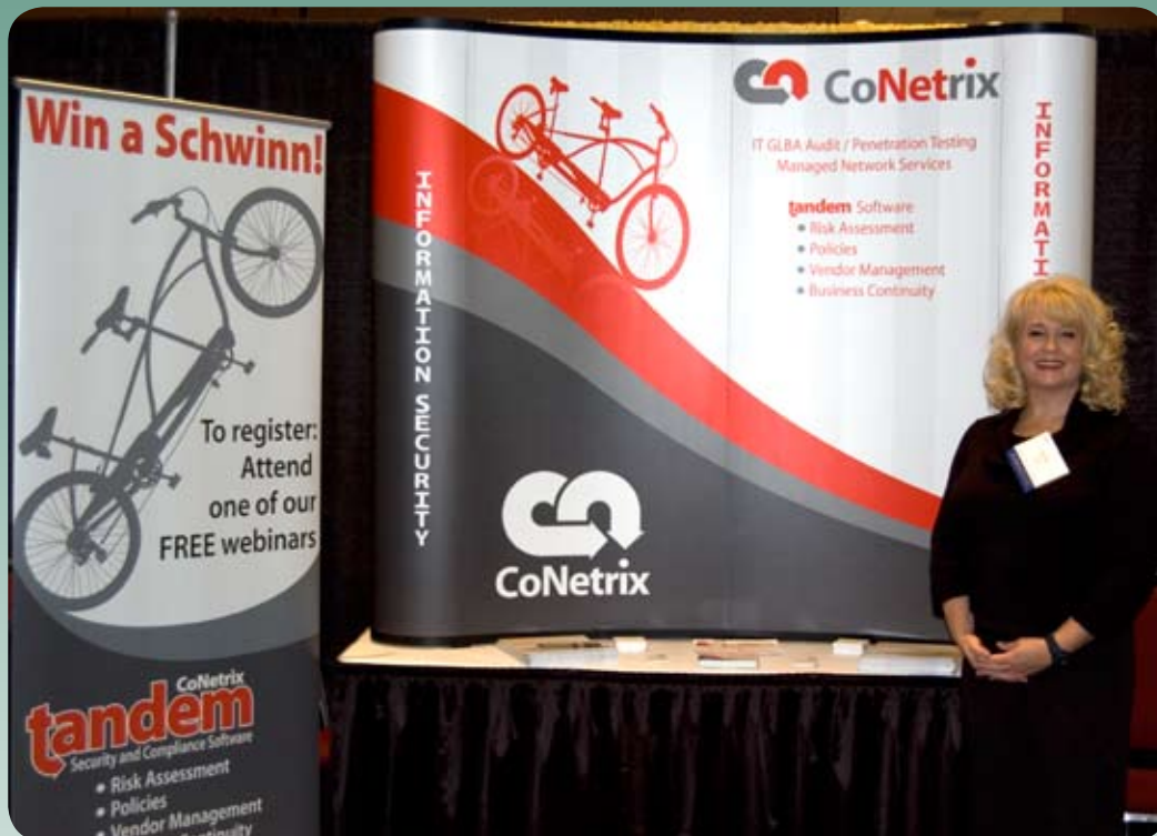
Exhibit and Sponsorship Opportunities

April 21-22, 2011 • Grand Traverse Resort